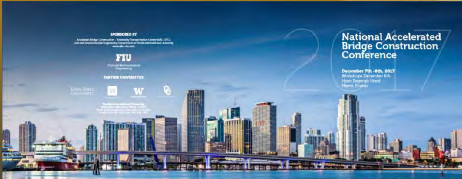
Exhibit Booths are available (about 20 booths still available)