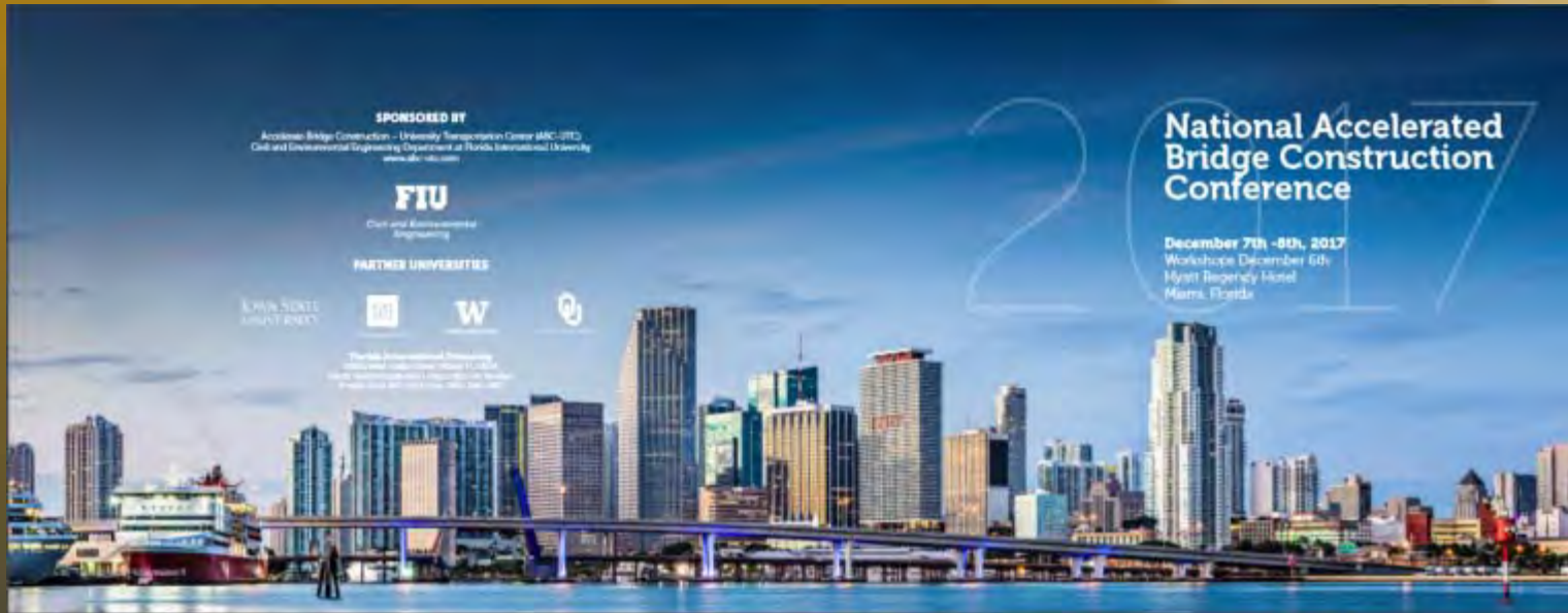
Exhibit at 2017 Conference

To reserve your exhibit booths, please Visit www.ABC-UTC.fiu.edu