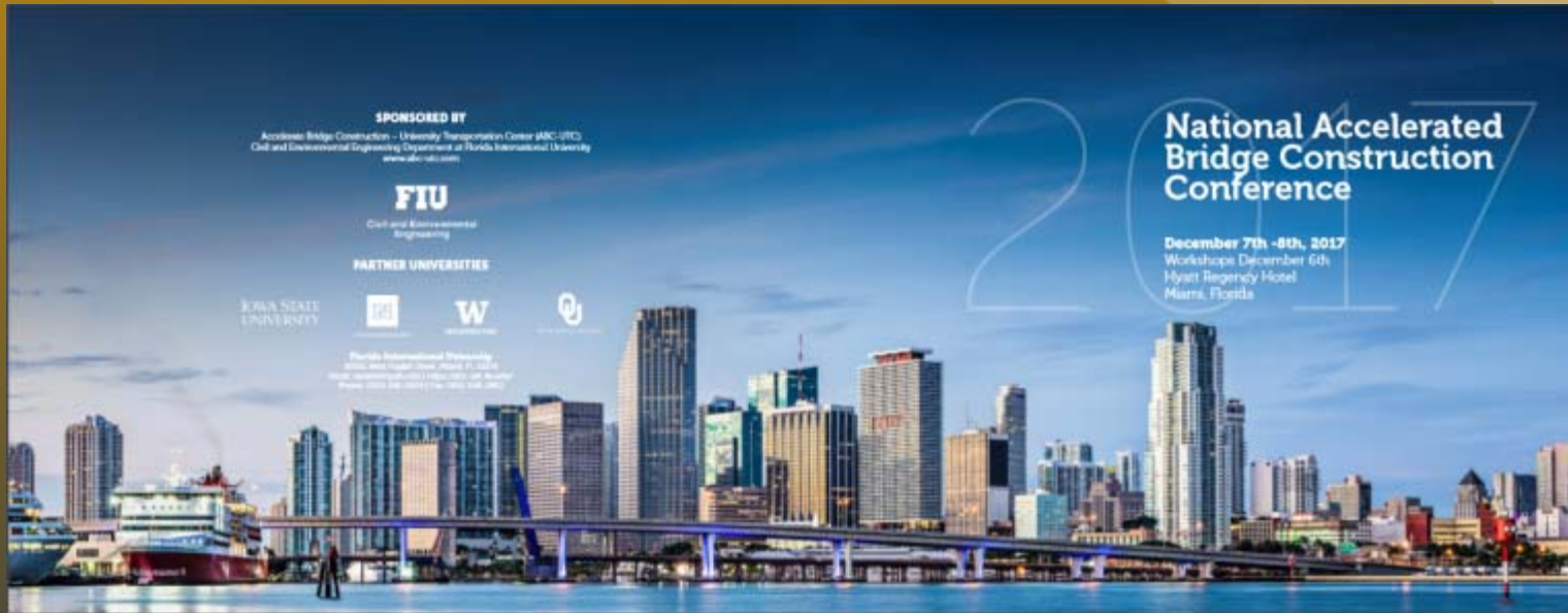
Exhibit at 2017 Conference

To reserve your exhibit booths, please Visit www.ABC-UTC.fiu.edu