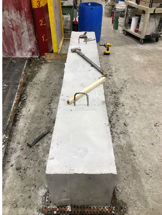
Figure 2. Reaction block for load testing specimens.