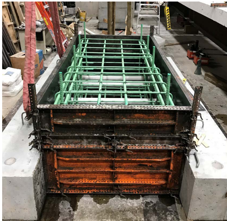
Figure 3. Grouted rebar coupler abutment cap fabrication.