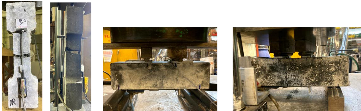
Figure 1. Material tests

This task has been completed. Some photos of the material tests performed are provided in Figure 1.